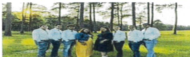
Next Generation Gospel Group